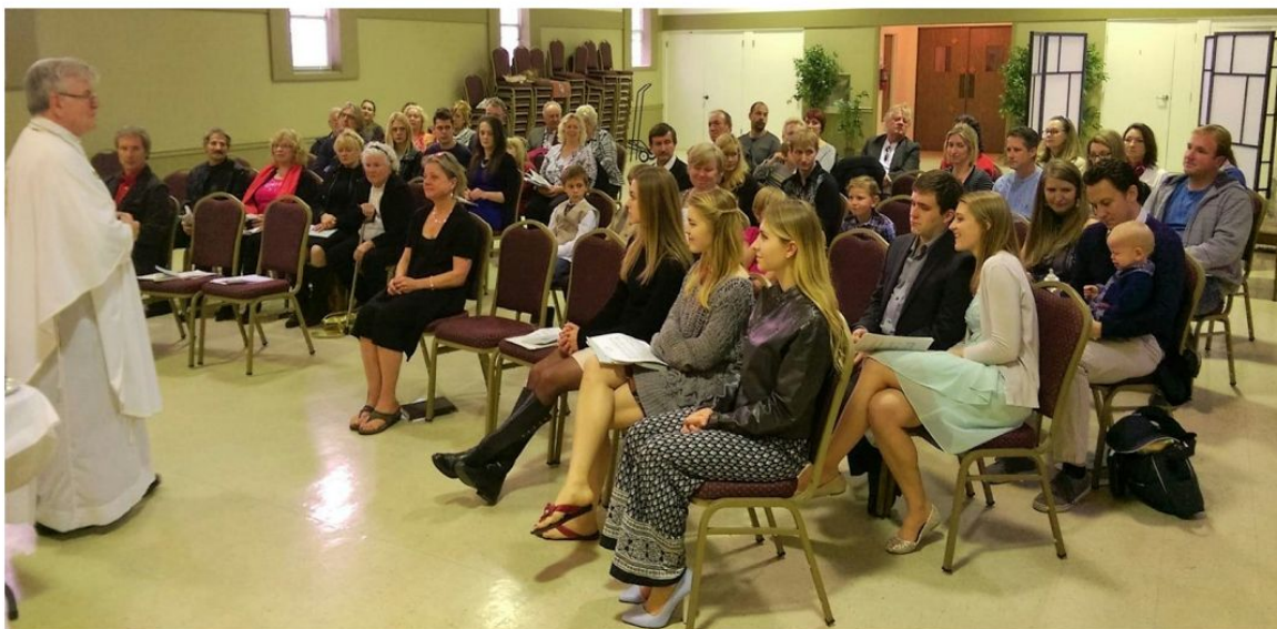
CHRISTMAS 2016 in San Diego.