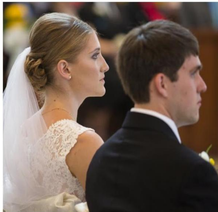
Left: The bride and groom in the church.