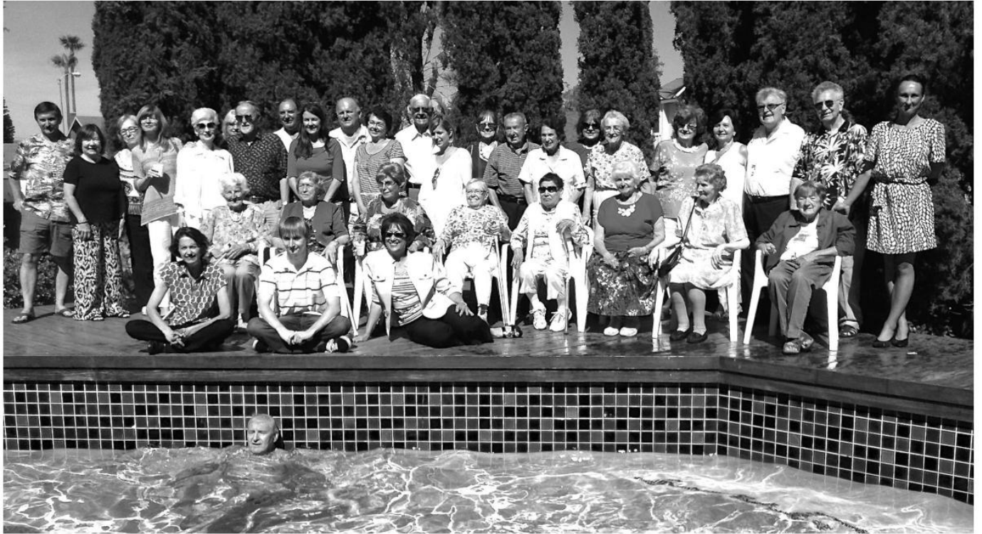
ÚČASTNÍCI PIKNIKU letos na Den otců, 15.června, na našem Velehradě.