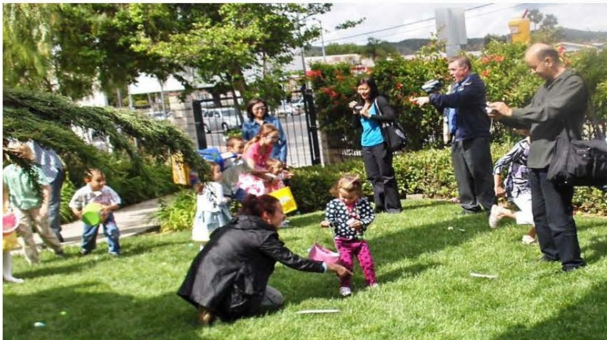
Even though it is the same every year, both children and parents enjoy the hunt for blessed Easter eggs.