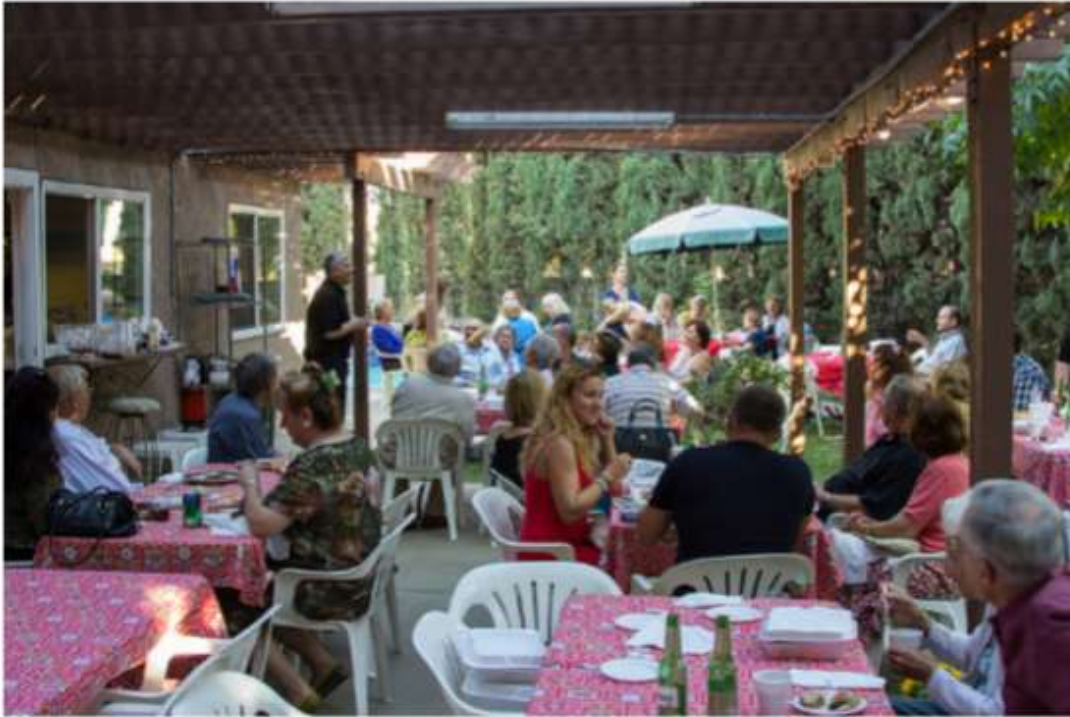
Bishop Malý (top left) answers questions at our picnic at our Velehrad in Placentia.