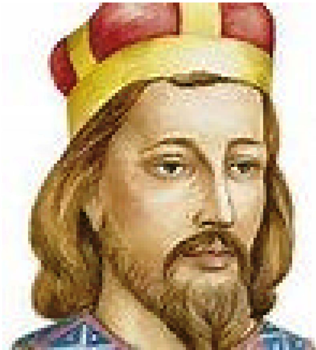
Saint Wenceslaus Patron of the Czech Lands

sv. Jakuba v San Diegu – sv. Františka v San Francisku - sv. Cyrila a Metoděje v Los Angeles