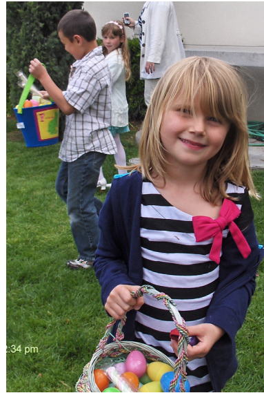
LA Easter Sunday Mass and Egg Hunt